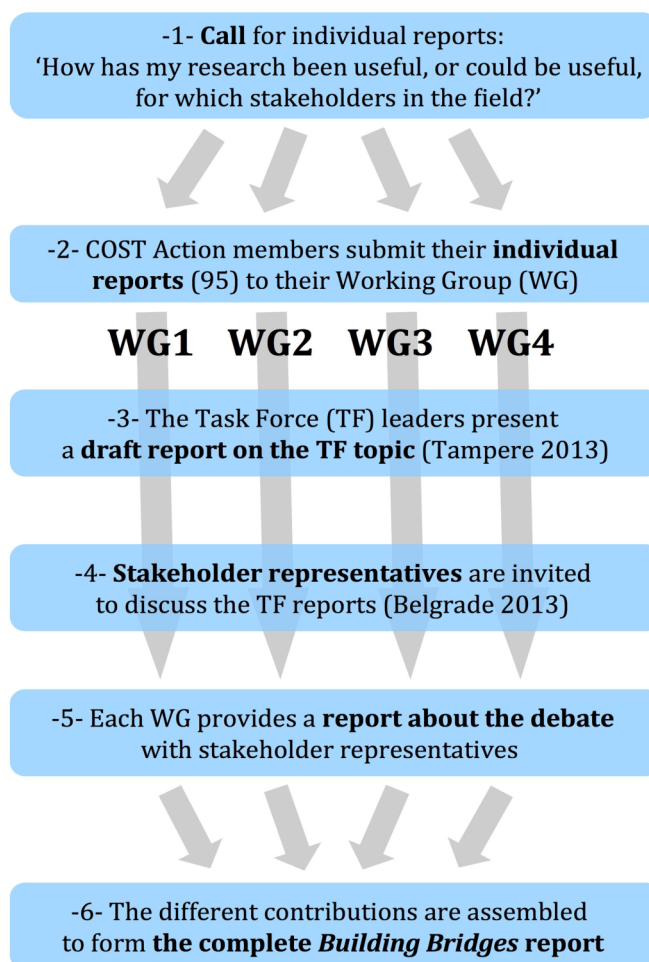
Figure 1. Building Bridges: A participatory process

This participatory writing process was only possible thanks to COST networking through the Action, which provided a platform for academic and non-academic groups with different interests, backgrounds and points of view to dialogue in a very open way and on a regular basis.